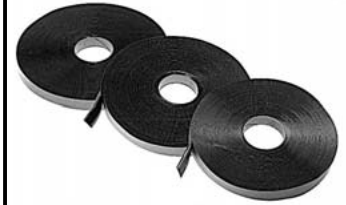
Sold per case only.

Some parts may be lead time items. Consult our sales department for availability.