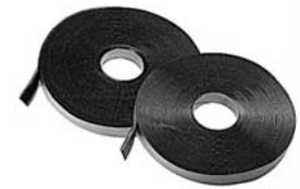
Sold per case only.

Some parts may be lead time items. Consult our sales department for availability.